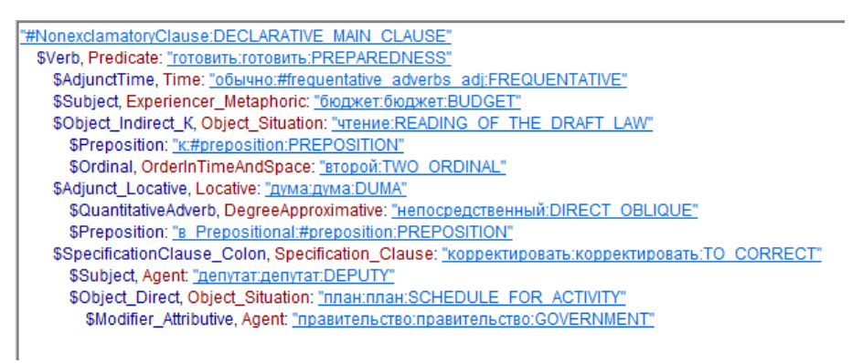
Figure 3: An example of the Compreno parse tree

As one can see, this format of markup representation does not contain morphological and other grammatical information. Nevertheless, after a sentence is annotated, the parser can build its parsing tree (see (Anisimovich et al., 2012)), where each token is provided with full grammatical and semantic data. Fig. 3 is an illustration of the Compreno parsing tree for the above given sentence, and fig. 4 being the fragment of the tree shows the morphological grammemes for the node "готовить: PREPAREDNESS".